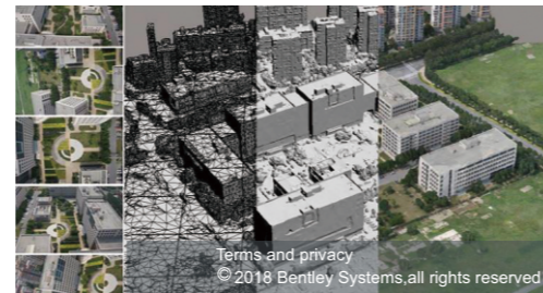
Terms and privacy © 2018 Bentley Systems, all rights reserved

Interactive monomer modeling, intelligent texture mapping, automatic retrieval of multi-angle images.